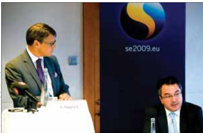
Figure 7: The Swedish Government, particularly Minister of Health Goran Hagglund, have helped define the problem of antibiotic resistance thus far

The infrastructure of antibiotic discovery in academia and the pharmaceutical industry has fallen to a dangerously low level. A prolonged loss of skills in both sectors means few people have experience of antibiotic discovery, especially of new classes. If a university or a company has no people engaged in antibiotic discovery, it is unlikely to produce new ideas in this area.