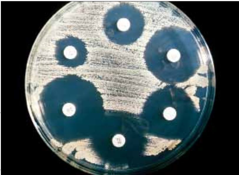
Figure 4: Culture-based methods remain the cornerstone of diagnosis and resistance testing

detection of many different targets, and high cost. Ideally, so-called sample-in to results-out technologies are needed that integrate sample preparation, amplification, detection, and analysis. The system should be able to detect pathogens and host biomarkers (proteins and nucleic acids) simultaneously. Sample preparation remains the largest bottleneck in miniaturised diagnostics: 134 large volumes (several millilitres of blood) need to be reduced to small amounts (in the order of microlitres); the microbial load in the sample can vary a lot and be very low; the target should remain intact, but many complex specimens contain nucleases or inhibitors of nucleic acid amplifications. Therefore, most sample preparations of available miniaturised molecular systems rely on many operations, and need several liquid additions and washing steps.