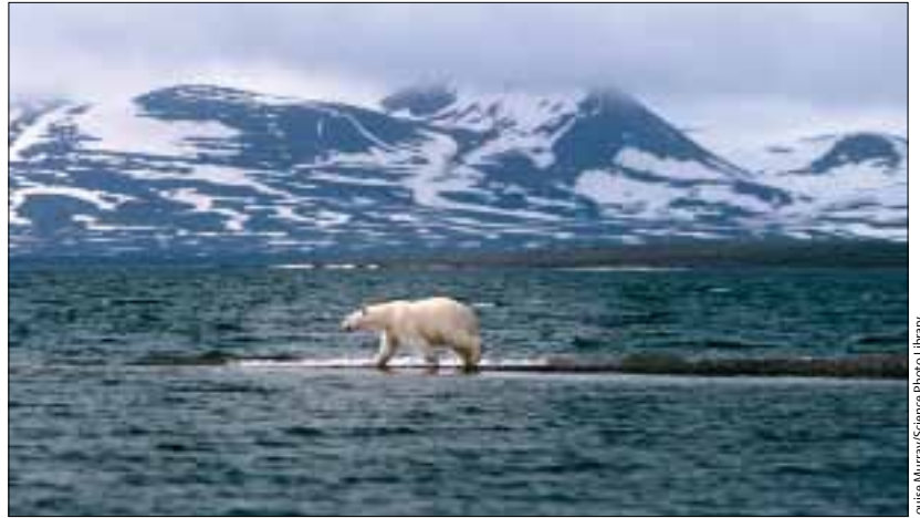
Figure 2: Antibiotic resistance in nature, such as that identified in polar bears in Svalbard, is likely anthropogenic

In the non-medical arenas of agriculture, aquaculture, and intensive farming, huge amounts of antibiotics are used in some countries—up to four-times the amount used in human medicine. 75 There is little separation of the types of antibiotic used in human beings and animals.