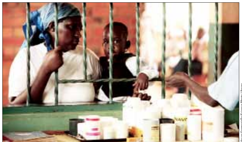
Figure 6: Dispensary staff are key in providing access to antibiotics, but also have a role in preventing excess

An effective new diagnostic test for bacterial acute lower respiratory infections could save at least 405 000 children's