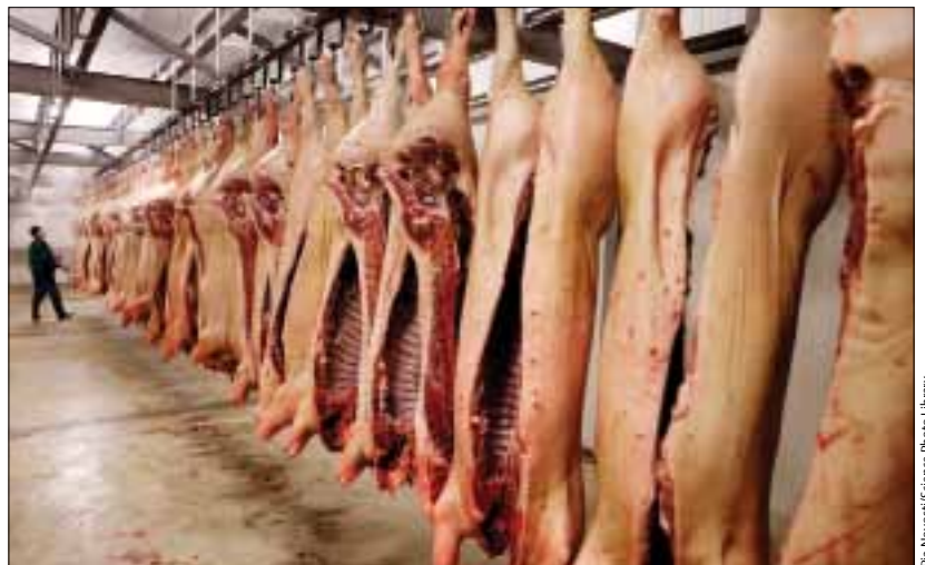
Figure 5: High standards of food processing can prevent contamination of food with bacteria

The detection of vancomycin-resistant enterococci with the vanA -gene cluster in animals in the EU triggered